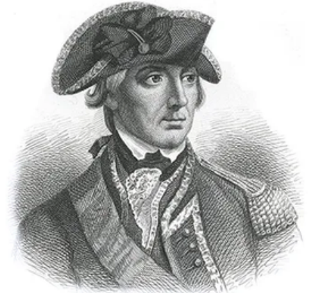
British General William Howe

As early as 1776, France was secretly supporting the colonies in the war with Britain. Many believe that their support of the colonies was much more about aiding any foe of their long term enemy. Nevertheless, they were secretly providing support. Fearing that France might soon enter the war, and combined with the fact that Britain's economy was still suffering from the debt accumulated in the French and Indian War, many members of the British parliament felt that the rebellion in the colonies must be brought to an end